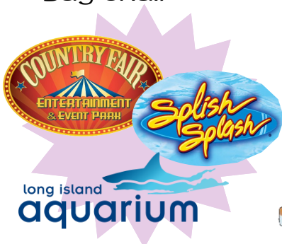
Summer Fun Basket*

* We'll be raffling off two of these prizes