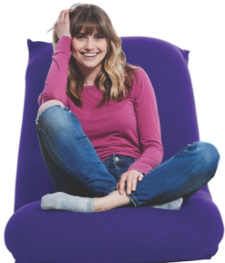
Yogibo Bean Bag Chair*