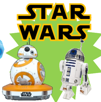
The Full Force Basket

With tickets to Splish Splash, Country Fair, LI Aquarium, Bronx Zoo, Boomer's and more!