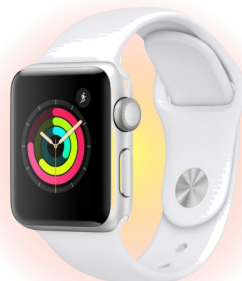
Apple Watch Series 3