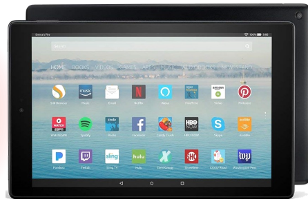
Kindle Fire HD 10

* We'll be raffling off two of these prizes