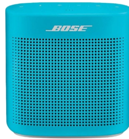
Bose Bluetooth Speaker*