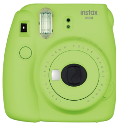
Instax Mini Camera