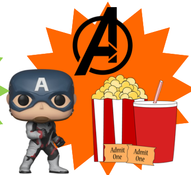
The MARVELOUS Basket

With a BB8 Sphero, an R2D2 Droid (needs app to operate) and more!