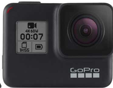
GoPro Hero 7