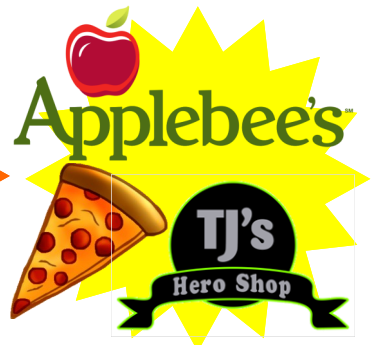
In The Mood For Food Basket

With tickets to Coram Movieland, Avengers Funko Pop figures & more!