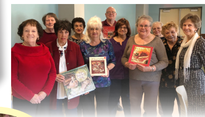
Thank you Friends volunteers