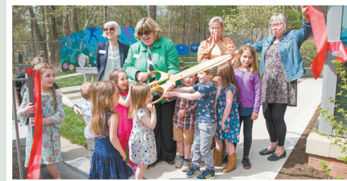
Learn & Play Children's Garden