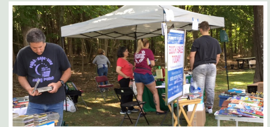
Brookhaven Country Fair at the Longwood Estate