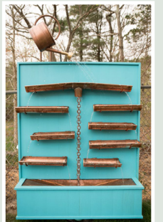
Musical Instruments & Waterwall - funded by the Friends