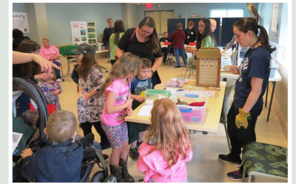
Earth Day Every Day